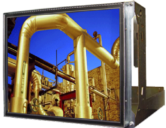
Chassis Base Provided by Customer