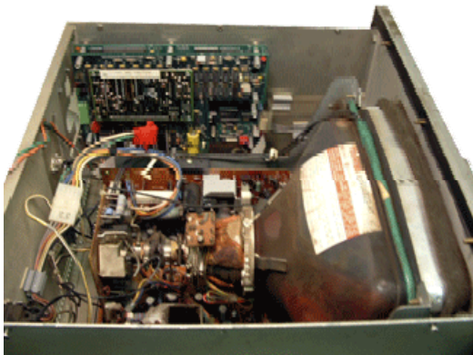
12" CRT Display Unit Model D12CB76 Toshiba